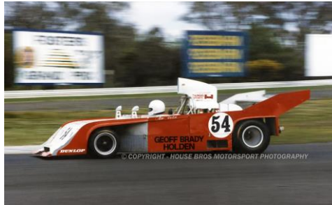
Alan Newton, Elfin MS7, turn 2 Sandown.

It was remarkable that Alan lived through one of the most spectacular accidents when the MS7 flew through the air at Calder.