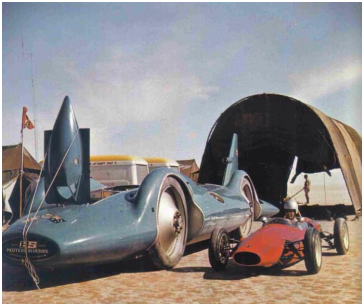
Bluebird Proteus CN7 and Elfin Catalina Ford at Lake Eyre in 1963.